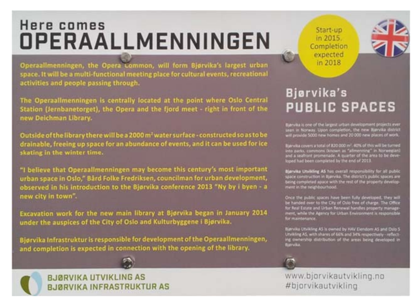
Figure 1: Information billboard outside the Opera building in Oslo summer 2014.

In 2008 Oslo got a new opera house (above). In the summer of 2014 visitors to the opera house met the following announcement: "Here comes the "Opera Commons".